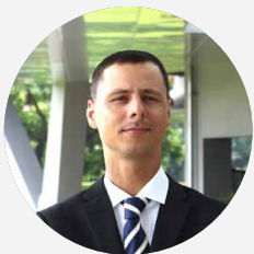
Rok Pintar Alumnus

Entrepreneurial Management: Venture Capital Investment Strategies