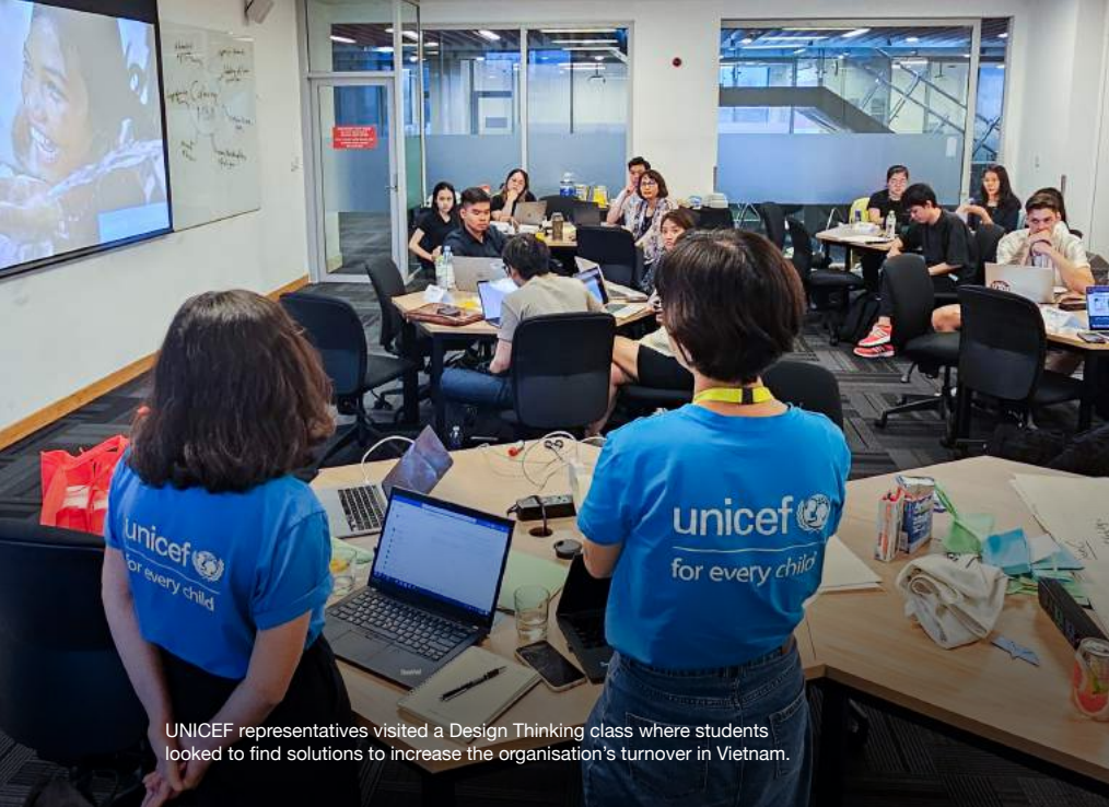
UNICEF representatives visited a Design Thinking class where students looked to find solutions to increase the organisation's turnover in Vietnam.